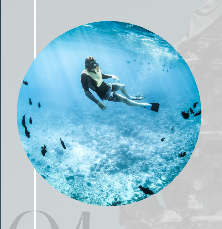
SNORKELING AND FISHING

+62 81338832125/ 081338832125 / +62 82146560733/ 082146560733